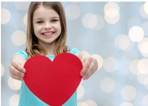
Sending kind wishes to ourselves and to others helps us feel better when we are down & nurtures compassion

Breathing is the heart of mindfulness. Breathing slowly and taking deeper breaths is a very effective tool to help lower symptoms of stress and anxiety, so you can be calmer and more relaxed.